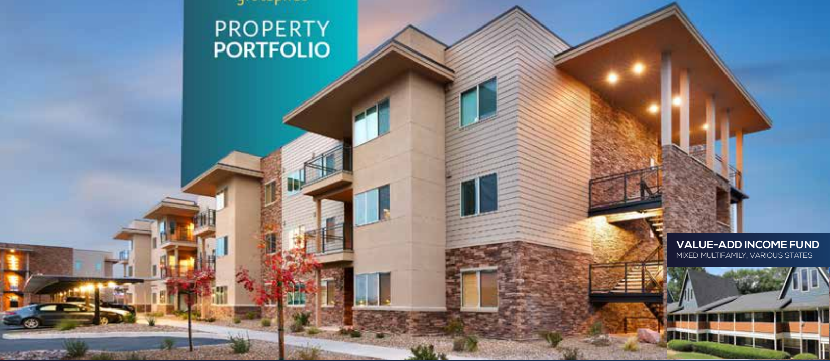
VALUE-ADD INCOME FUND MIXED MULTIFAMILY, VARIOUS STATES