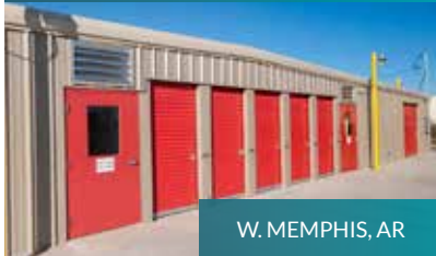
W. MEMPHIS, AR