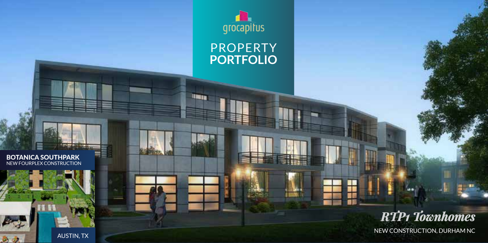
BOTANICA SOUTHPARK NEW FOURPLEX CONSTRUCTION